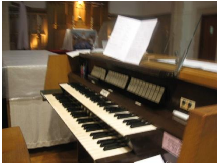
Casavant Organ Console